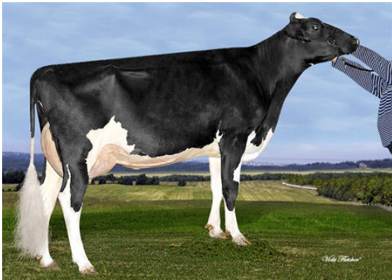
STE ODILE SUPERSHOT ELECTRA DAM