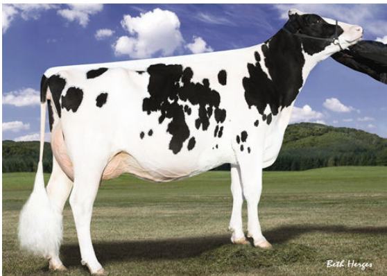
LARCREST CRIMSON FIFTH DAM