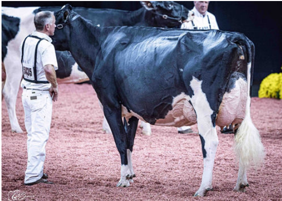
RJR DISCJOCKEY 7509 DAUGHTER