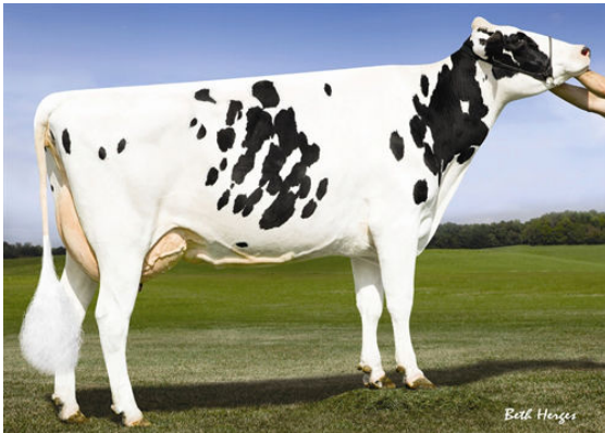
REGANCREST DORCY BENISHEY THIRD DAM