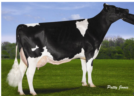
VISION-GEN SH FRD A12304 FOURTH DAM