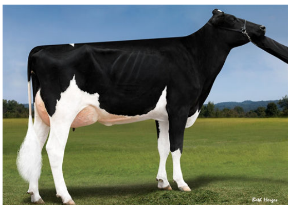
PROGENESIS MONTANA GALATEA DAM