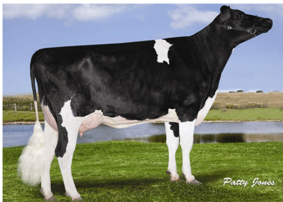
MORMANN SR GINGERBRED THIRD DAM