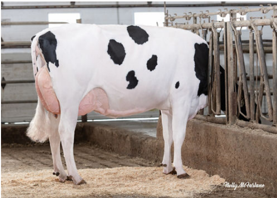
PROGENESIS EINSTEIN WIMZY DAUGHTER