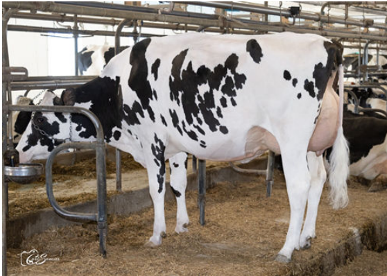
MONTMAGNY PRAGMATIC SAFALA

L TO R - MONTMAGNY PRAGMATIC SAFARIA, MONTMAGNY PRAGMATIC SAFALA