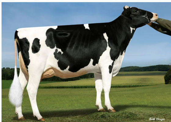
SANDY-VALLEY RBCN LOGAN DAM