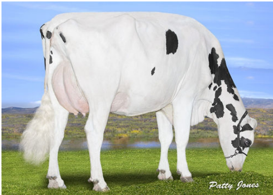
PROGENESIS DETOUR KANSAS DAM