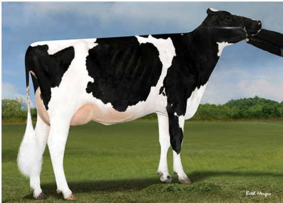
PROGENESIS SUPERSHOT KASSIDY GRANDDAM