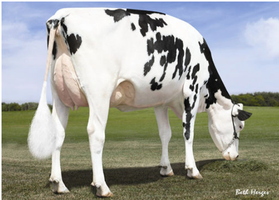
MS C-HAVEN OMAN KOOL FOURTH DAM