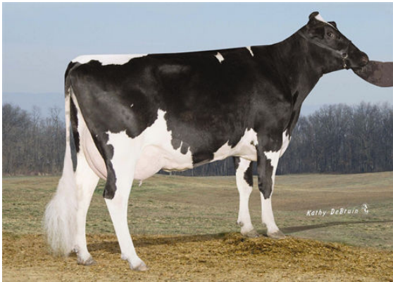
PINE-TREE MONICA SUELA FIFTH DAM