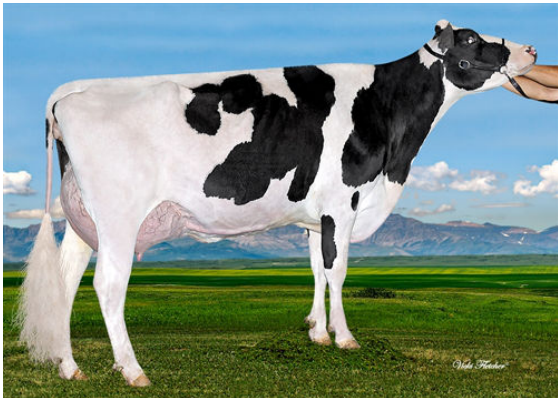
MS SOFIAS DELTA SKY GRANDDAM