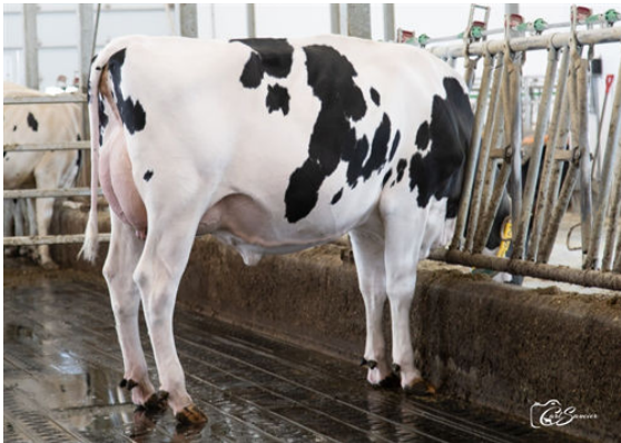
LEOTHE MOLIERE DESSINE DAUGHTER