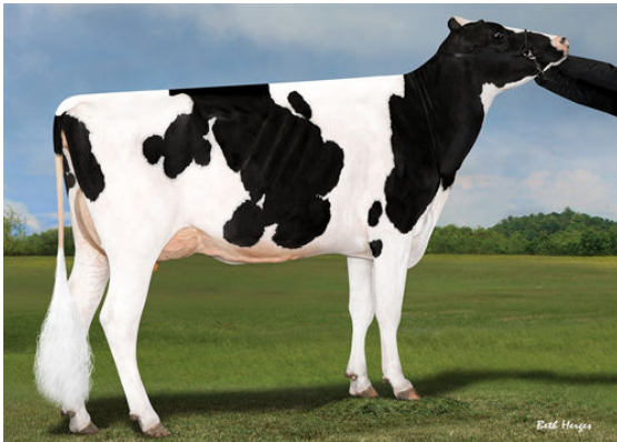
SYNERGY RUBICON PERFECT GRANDDAM