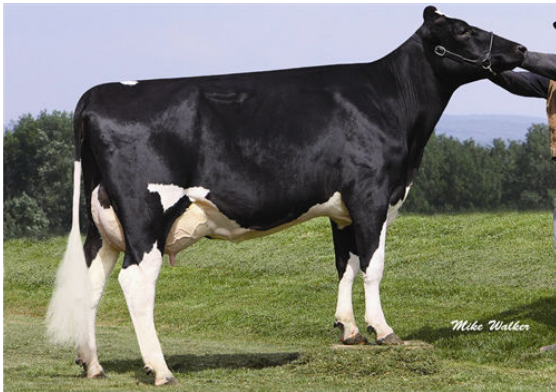
COYNE-FARMS FREDDIE JILL FIFTH DAM