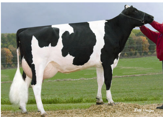
SANDY-VALLEY BOLT SHEILA FIFTH DAM