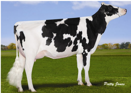
GEN-I-BEQ SNOWMAN SUMMER FOURTH DAM