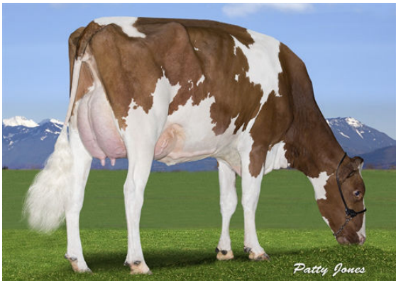
WESTCOAST ATWORK SHAE 3109 RED GRANDDAM