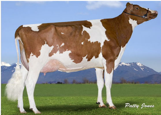
WESTCOAST ATWORK SHAE 3109 RED GRANDDAM