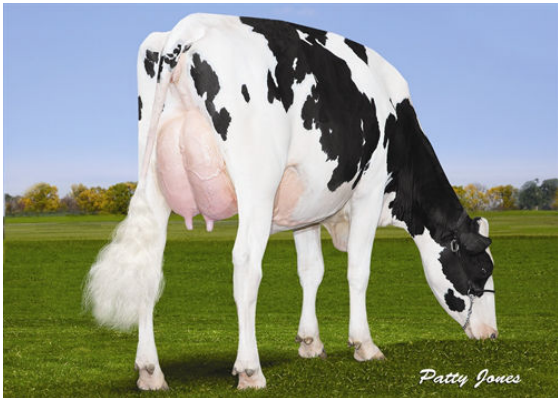
OCCONNORS LAST HOPE GRANDDAM