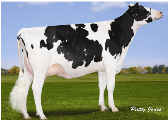
OCCONNORS LAST HOPE GRANDDAM