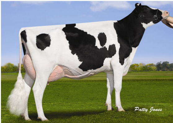
OCCONNORS PLANET LUCIA THIRD DAM