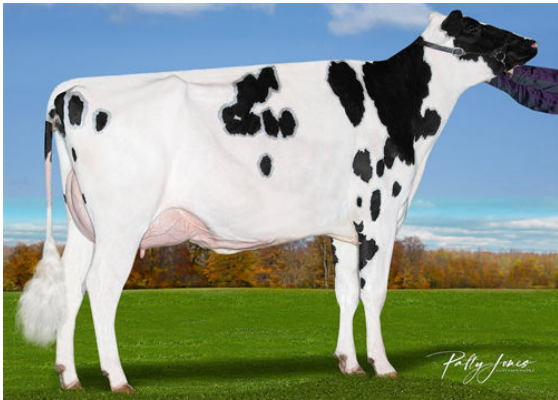
VOGUE REDEYE LOVE AFFAIR-P DAUGHTER