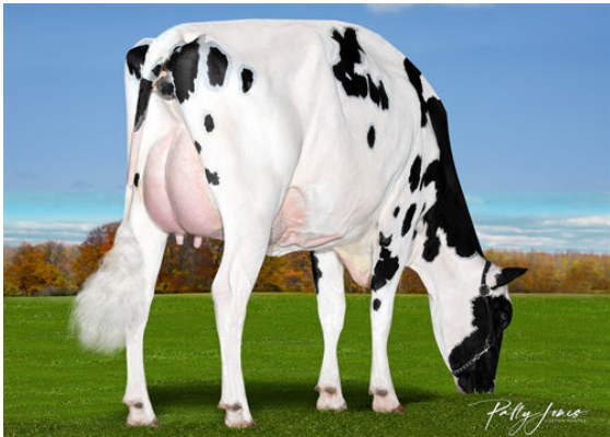
VOGUE REDEYE LOVE AFFAIR-P DAUGHTER