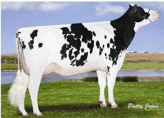
RUSSELLWAY CAMERON PINKY