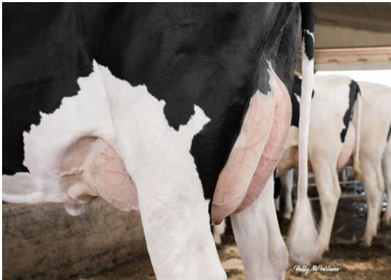
PROGENESIS FORTUNE PALAU