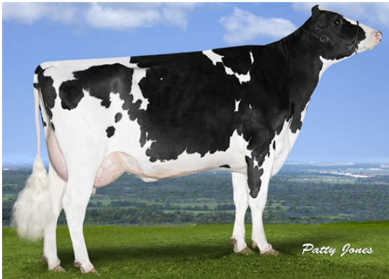
PROGENESIS ENFORCER PAT