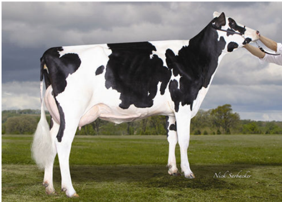
RICHMOND-FD S BARBARA FOURTH DAM