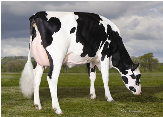
RICHMOND-FD S BARBARA FOURTH DAM