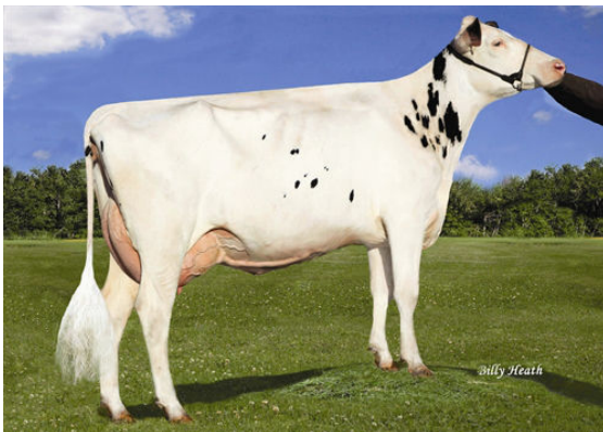
RICHMOND-FD BARBIE FIFTH DAM