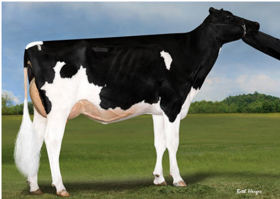
PROGENESIS DOORSOPEN HAZEL GRANDDAM