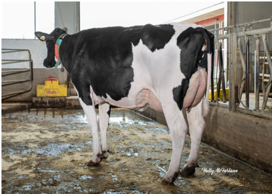
PROGENESIS IMAX HIJINKS DAM