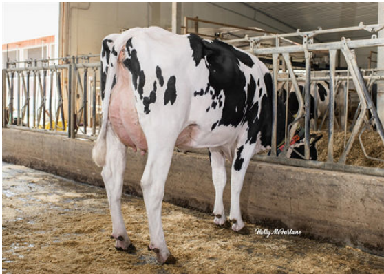
PROGENESIS IMAX PERFECTION DAM