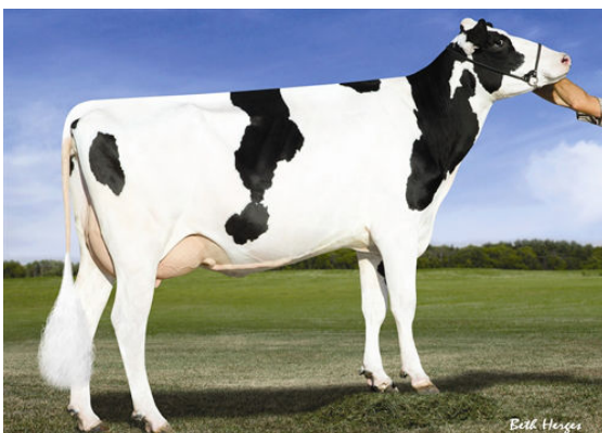
SANDY-VALLEY ROBUST RUBY FOURTH DAM