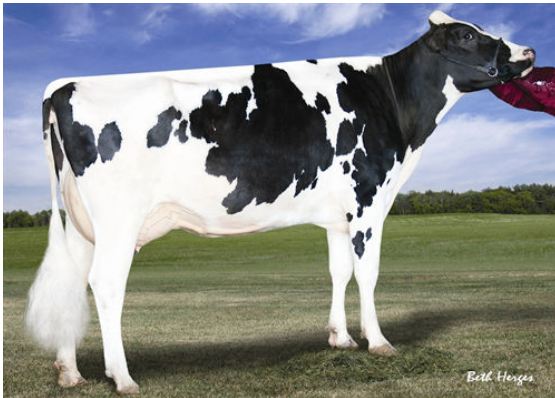
APLOUIS JET STREAM ALDA FIFTH DAM