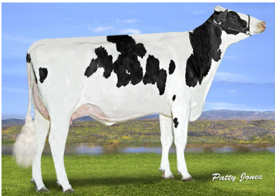
PROGENESIS MONTANA BEAUVAIS GRANDDAM