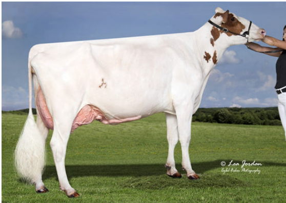
MIDAS-TOUCH ARIANA-RED GRANDDAM