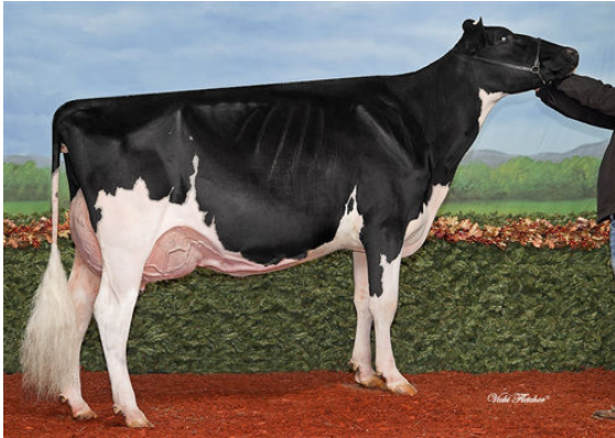
GEN-I-BEQ SNOWMAN AKILIANE THIRD DAM