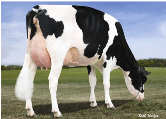
MORSAN MAN D MISSY FIFTH DAM