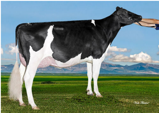
BGP MODESTY IMOGENE GRANDDAM