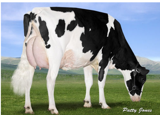
EDG RUBY UNO RIZA FOURTH DAM