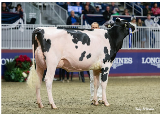
BLONDIN STARS ALICE DAUGHTER