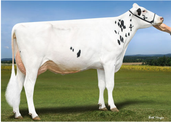
LADYS-MANOR GRNT OOHM DAM