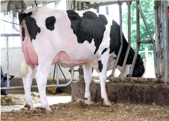
BOFRAN LUGNUT FRIGGY DAUGHTER