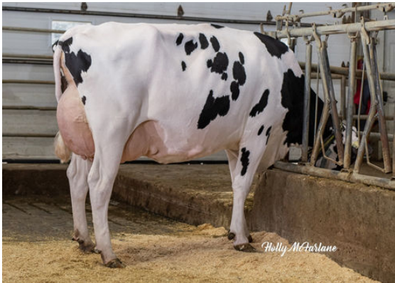
PROGENESIS JEDI MENACE GRANDDAM