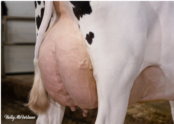
PROGENESIS JEDI MENACE GRANDDAM