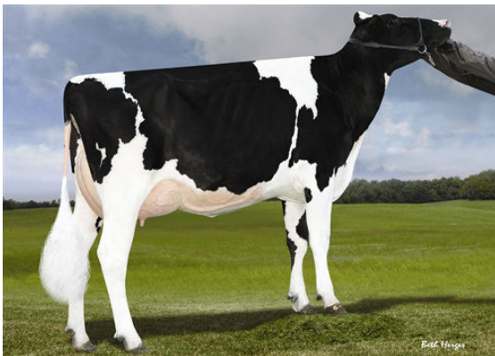
LADYS-MANOR S DAHLIA FIFTH DAM