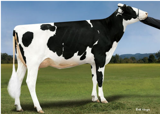
PROGENESIS MODESTY MISSILE GRANDDAM