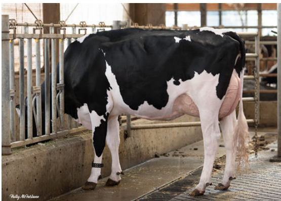
PROGENESIS WC 13179 DAUGHTER