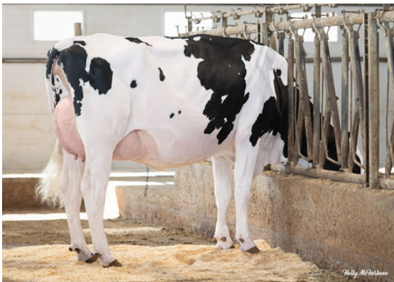
PROGENESIS GRAZIANO ELSA P DAUGHTER