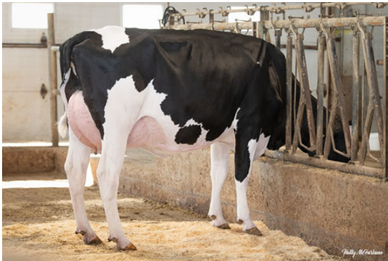
PROGENESIS GRAZIANO JAZMATIC DAUGHTER