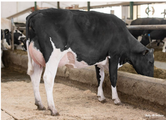
REDSTONE SUGARHIGH HARMONY DAUGHTER