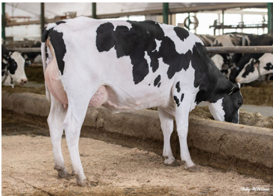
REDSTONE SUGARHIGH GRECIA DAUGHTER