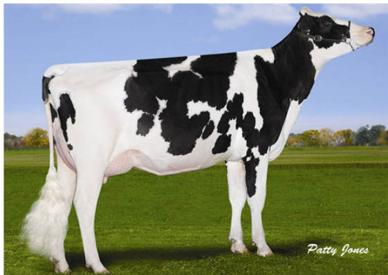
GEN-I-BEQ SNOWMAN SUMMER THIRD DAM