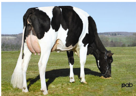
GEN-I-BEQ BOLTON SECRETLY FOURTH DAM