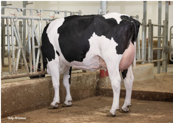
CLAYNOOK ZINCO MONTEVERDI DAUGHTER