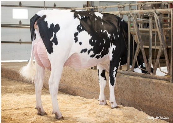
PROGENESIS MONTEVERDI HOTTIE P DAUGHTER