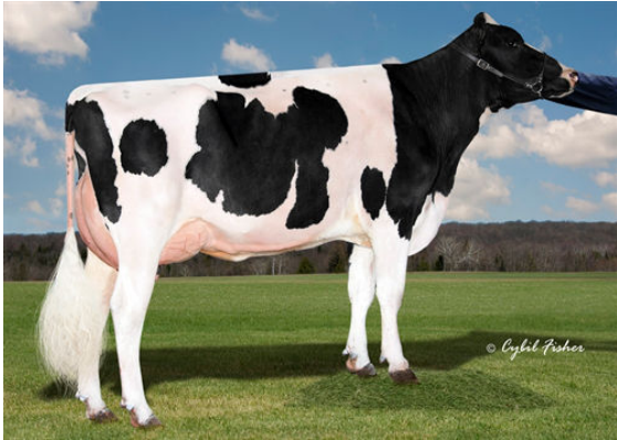
COOKIECUTTER RUBI HOMEY GRANDDAM