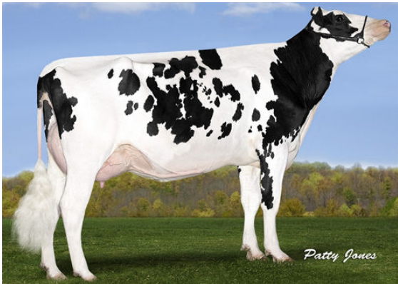
SILVERRIDGE V MUNITION EARWIG FOURTH DAM