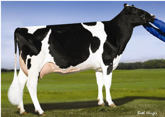
PINE-TREE 2149ROBST 4846 FOURTH DAM