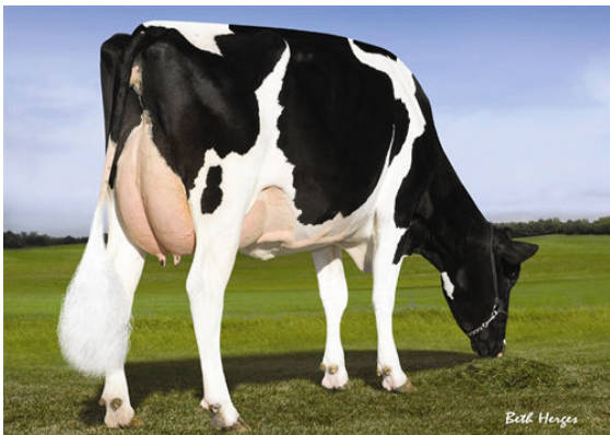
PINE-TREE 2149ROBST 4846 FOURTH DAM