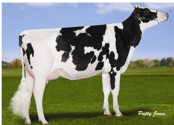
GEN-I-BEQ SNOWMAN SUMMER FIFTH DAM