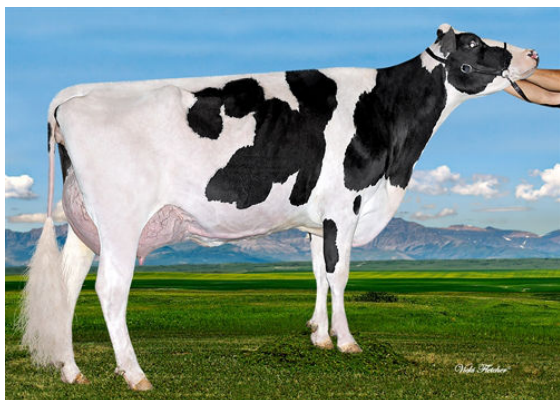
MS SOFIAS DELTA SKY THIRD DAM