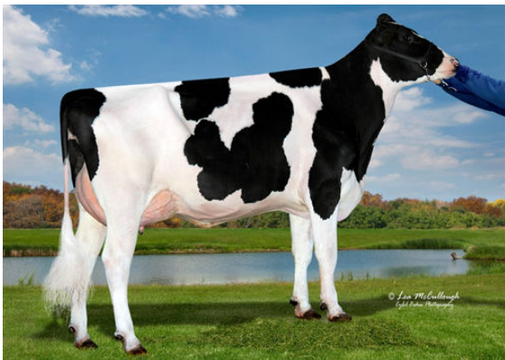
OCD DOORMAN 9689 THIRD DAM