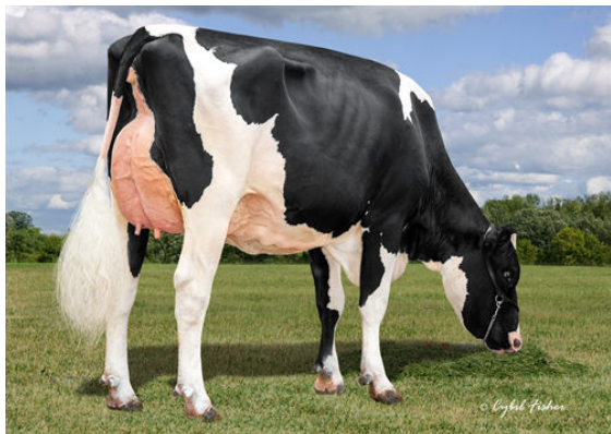
AOT POSITIVE HALLMARK