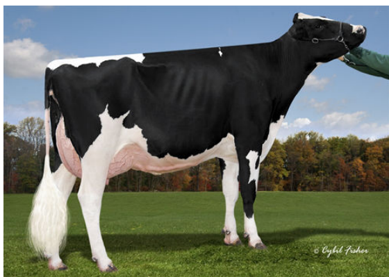
COOKIECUTTER DTA HABITAN