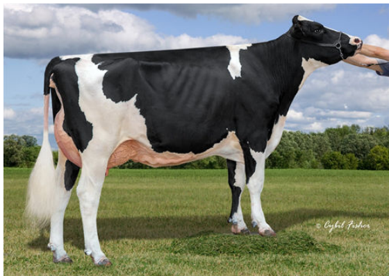
AOT POSITIVE HALLMARK