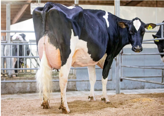
SIEMERS LMDA PARIS 27856 DAM