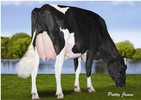
RANSOM-RAIL FACEBK PARIS FOURTH DAM