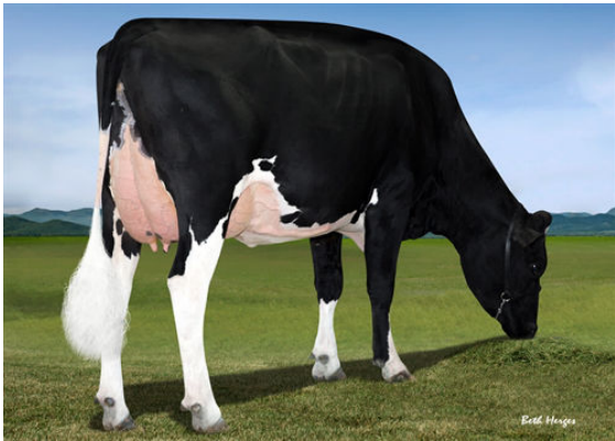
FAIRMONT TUFFENUFF RIDGE FOURTH DAM