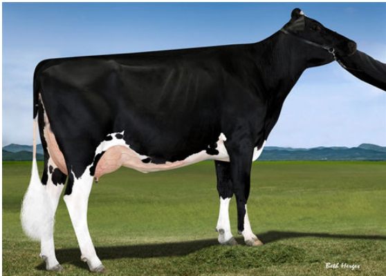
FAIRMONT TUFFENUFF RIDGE FOURTH DAM