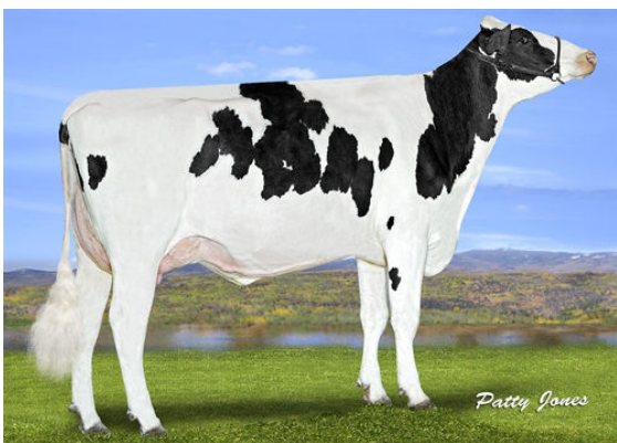
PROGENESIS MONTANA BEAUVAIS THIRD DAM