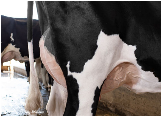
PROGENESIS OUTL WINTERBERRY GRANDDAM