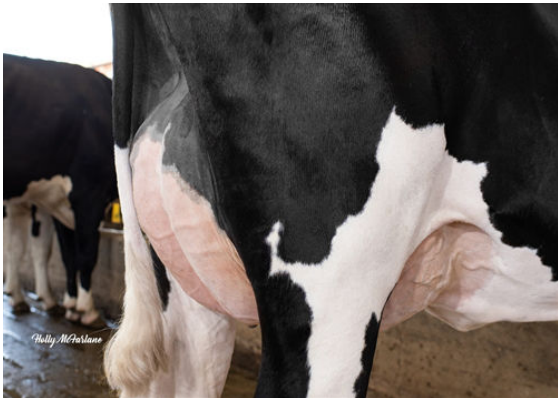
PROGENESIS OUTL WINTERBERRY GRANDDAM