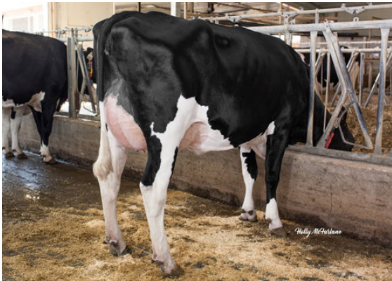
PROGENESIS OUTL WINTERBERRY GRANDDAM