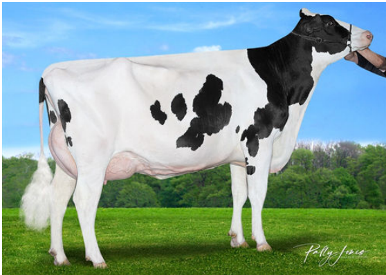
CLAYNOOK ZEETA PURSUIT DAM